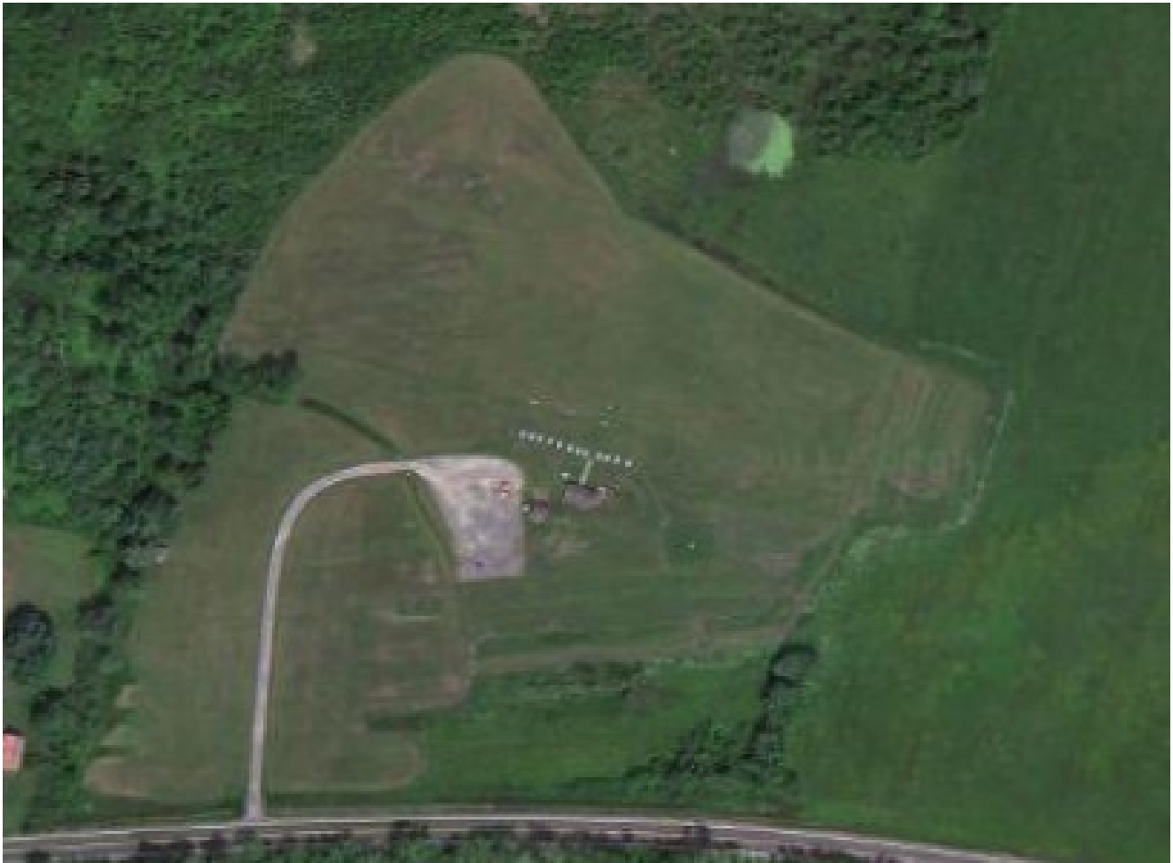
STARS Field Satellite photo